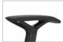
Fixed nylon, graphite