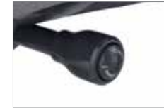
Right side: Tilt lock and tilt tension adjustment