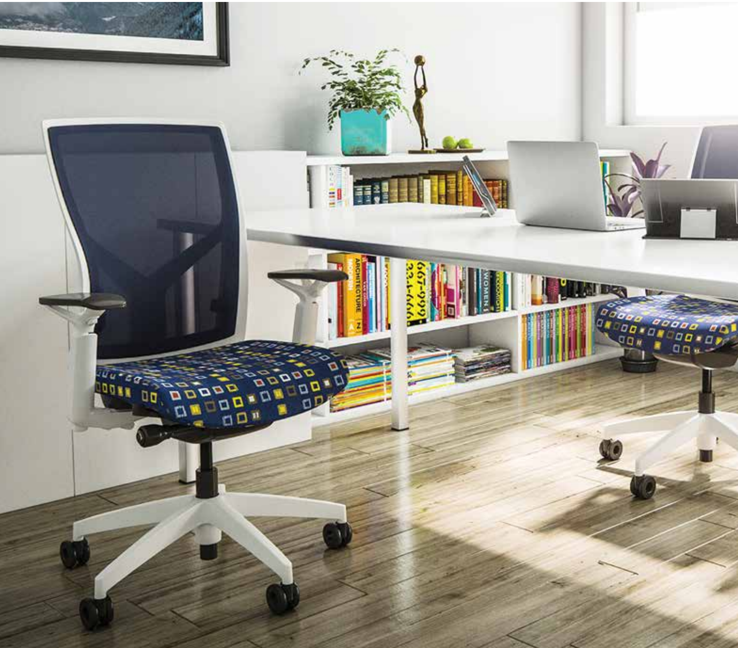
TEXTILES: Navy mesh (back), Momentum Avenue Pacific Diffuse (seat)

Inspirational design and cable-driven control coupled with adjustable lumbar support and seat depth adjustment make Torsa a superb choice for a manager's office.