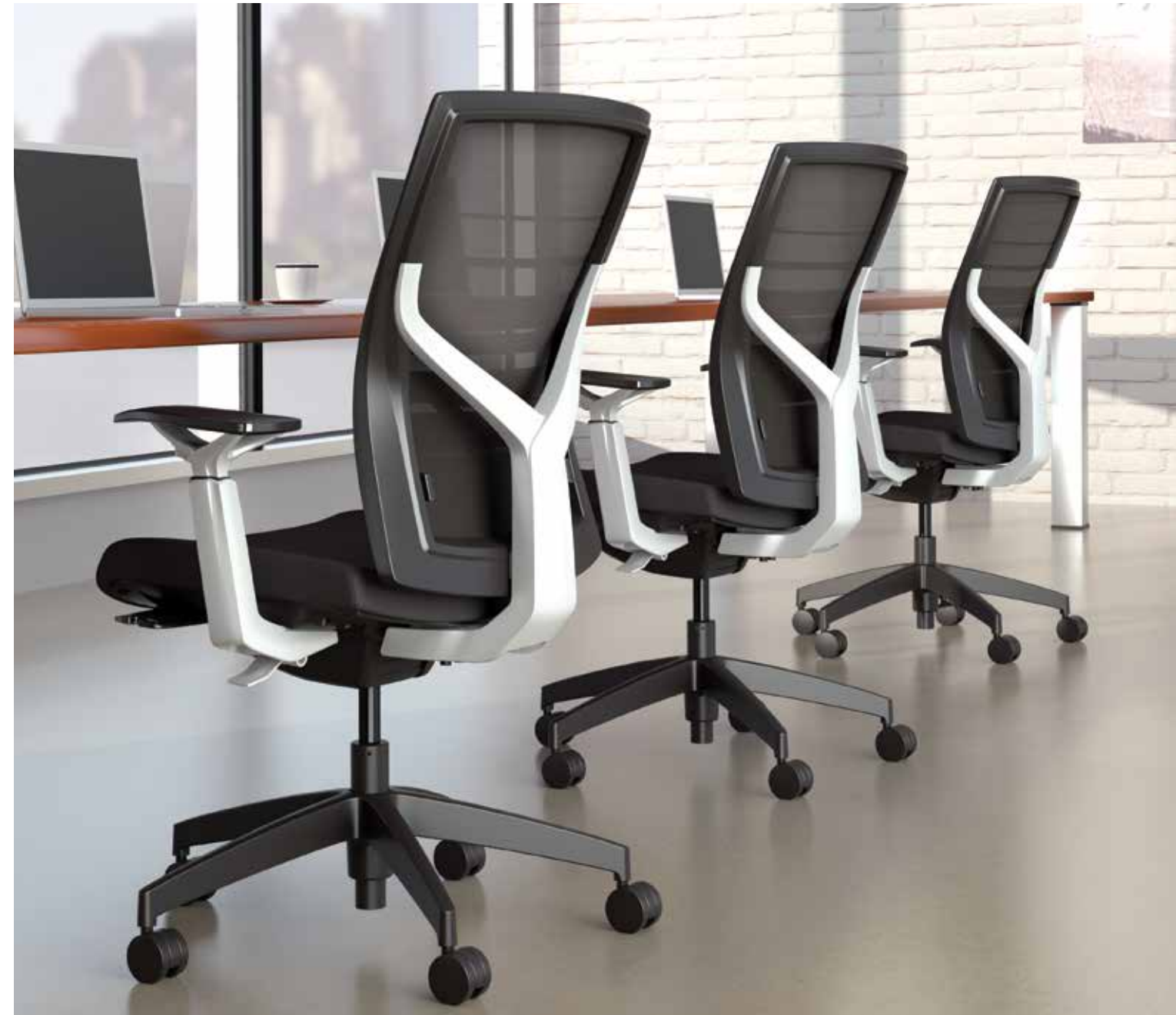
TEXTILES: Onyx Stripe mesh (back), Momentum Solace Ebony (seat)