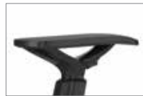
Multi-adjustable (height/width) nylon, graphite