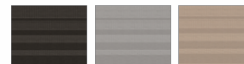
Onyx Stripe Fog Stripe Desert Stripe