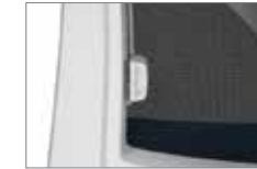
Adjustable lumbar support