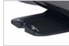
Left side: Seat height adjustment, seat depth adjustment