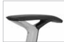
Fixed nylon, white

Multiple arm options accommodate varied tasks and user preferences.