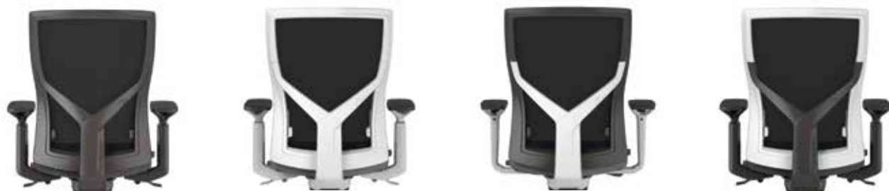
Graphite frame with graphite arms and back support.