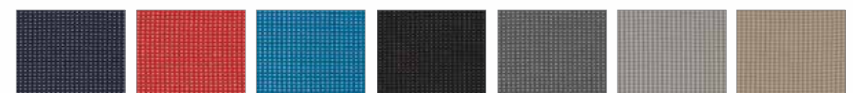
Navy Fire Electric Blue Onyx Nickel Fog Desert