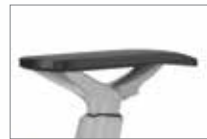
Multi-adjustable (height/width) nylon, white