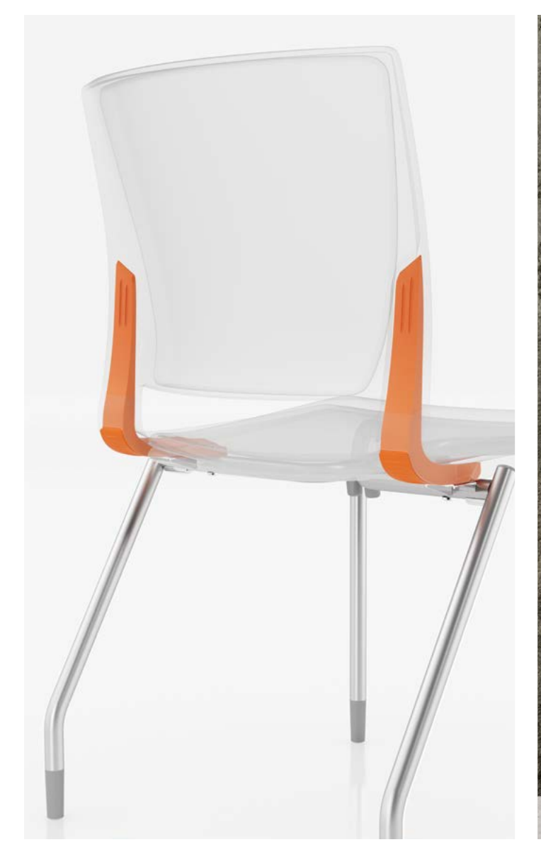
We started with an extra-durable polymer commonly used in high-impact fitness gear that requires extreme stability during movement.

Discover Active Rebound Control (ARC) Technology—a performance-minded flexor insert that supports a wide range of motion (20 full degrees to be exact) and responds precisely to the amount of weight pressed against it. Experience personalized flexibility that moves with you.