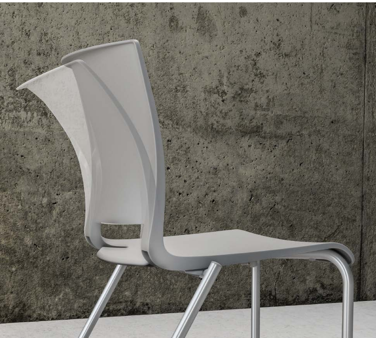
After molding it into a unique, tapered flexor insert, we tested how far we could slim it down without compromising its performance.