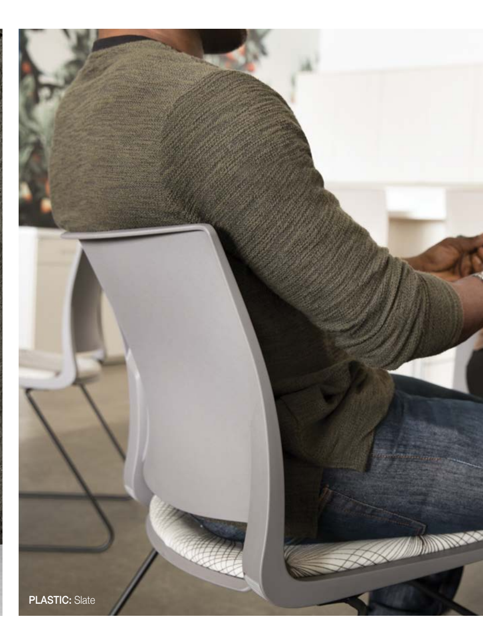
The result? A personalized, weight-assisted flex mechanism encased in a shell that's ultra-light and extra-slim. (Translation: Maximum flexibility—with minimal bulk.)