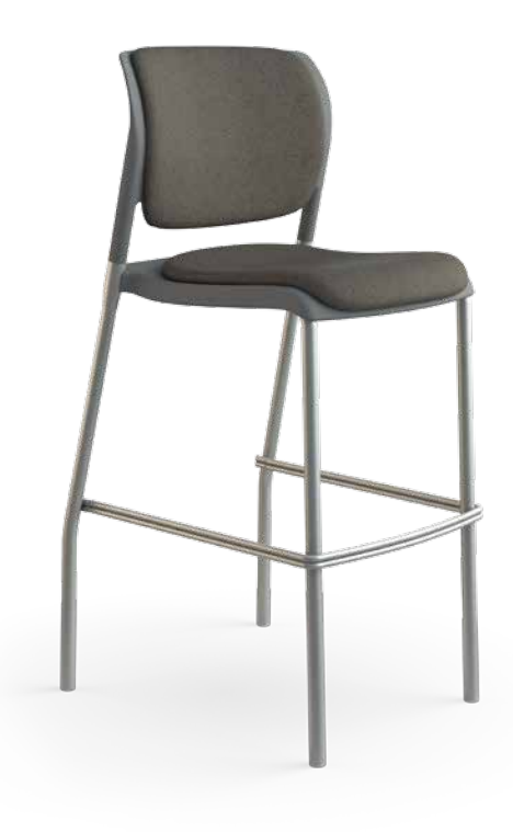
MODEL: Café Stool PLASTIC: Slate FRAME: Silver TEXTILES: Maharam Milestone Pewter