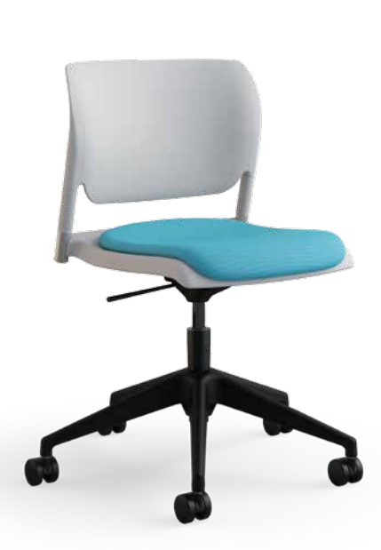
MODEL: Task Chair PLASTIC: Sterling FRAME: Silver TEXTILES: Maharam Messenger Hydrangea