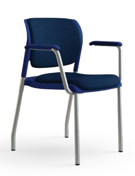
MODEL: 4-Leg PLASTIC: Blue FRAME: Silver TEXTILES: Maharam Division Fountain