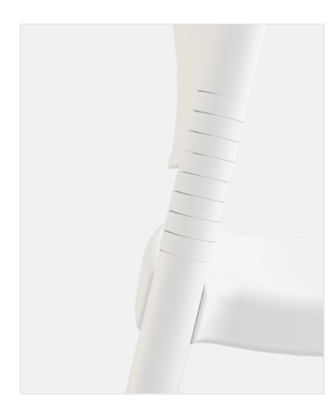
When it comes to natural back support, the InFlex flex-back motion delivers the most evolved ergonomic solution available today. When the user reclines, the stacked disc system and steelspring rods work in unison, inspired by the movement of the spinal column to offer personalized support and comfort.