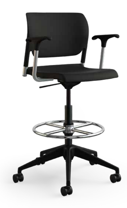
MODEL: Task Stool PLASTIC: Black FRAME: Silver