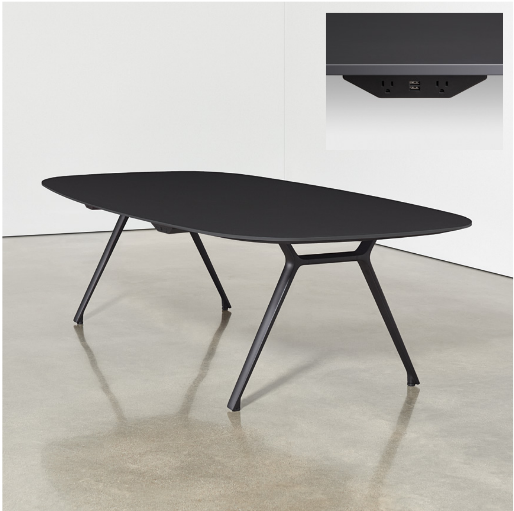
RIGHT | Soft-touch power modules at the perimeter edge deliver connectivity to your fingertips.