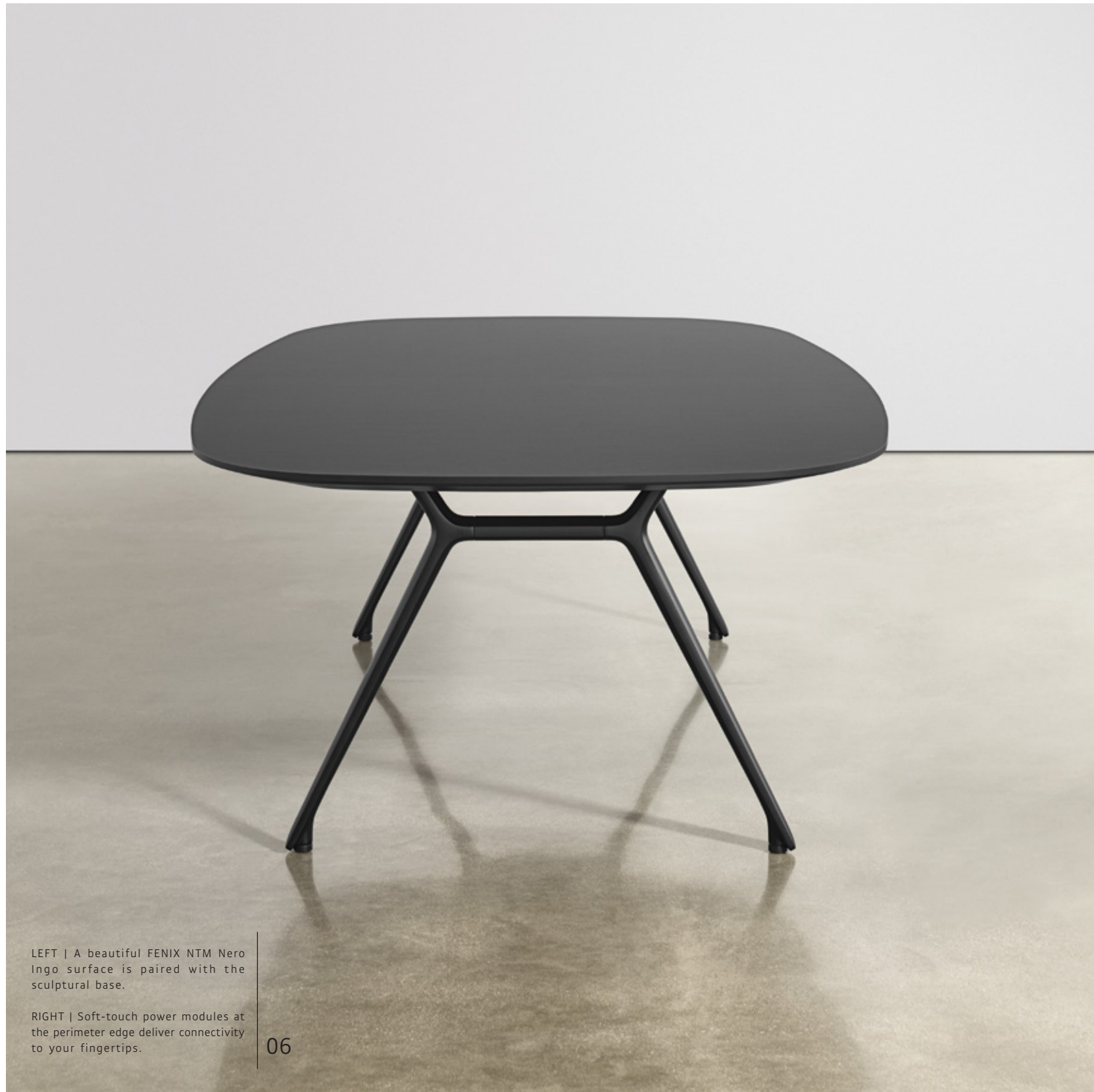
LEFT | A beautiful FENIX NTM Nero Ingo surface is paired with the sculptural base.